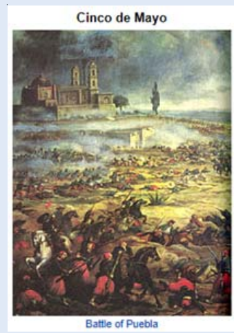
Battle of Puebla